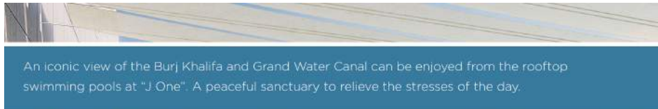
An iconic view of the Burj Khalifa and Grand Water Canal can be enjoyed from the rooftop swimming pools at "J One". A peaceful sanctuary to relieve the stresses of the day.